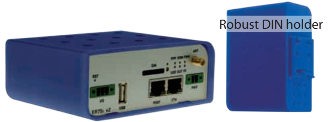
Version standard - plastic housing