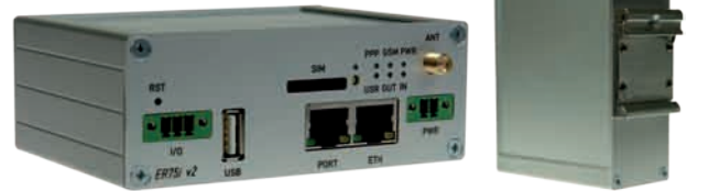
Version SL - metal housing