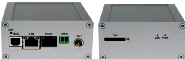
Version SL - metal cover