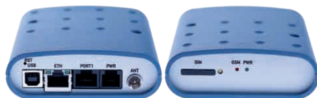
Standard version in plastic cover