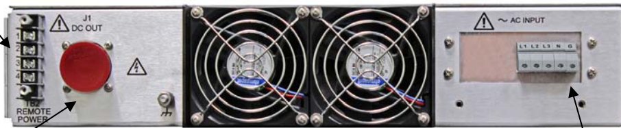
Input chassis rear view Three-phase 3KVA